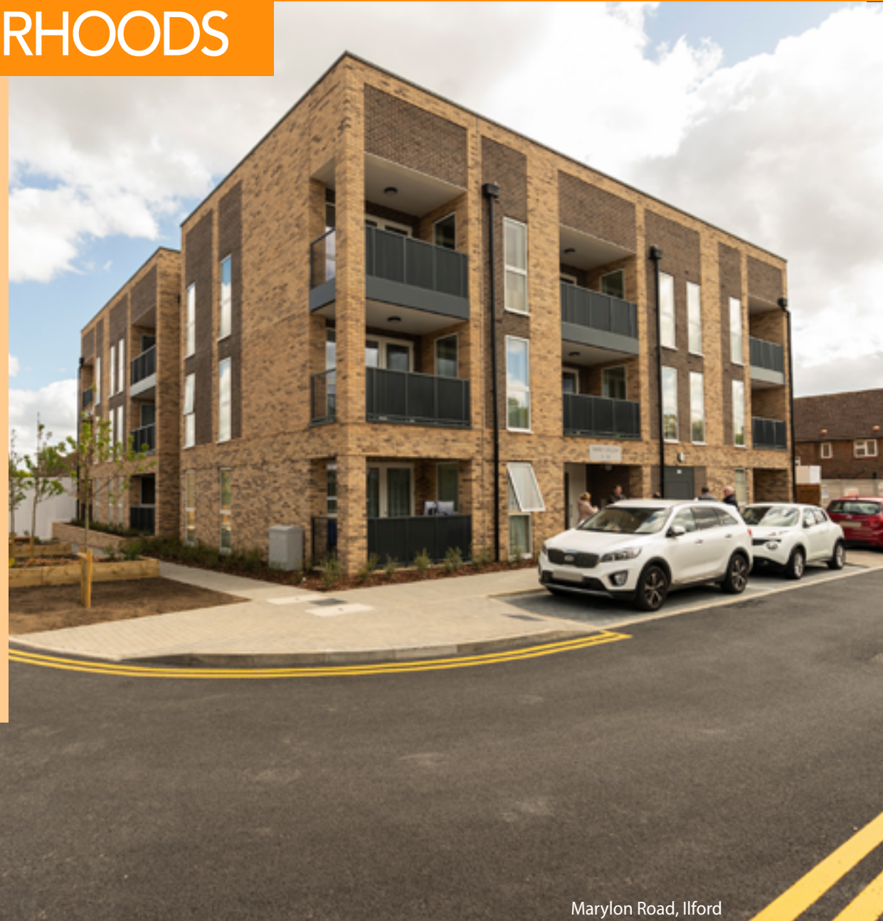
Marylton Road, Ilford

Our new Hubs will be based across the borough providing excellent facilities, support, and services. We will develop these in partnership with local people and we will create the right approaches according to the issues that matter most locally. Our ambition is to deliver all the Hubs by 2030.