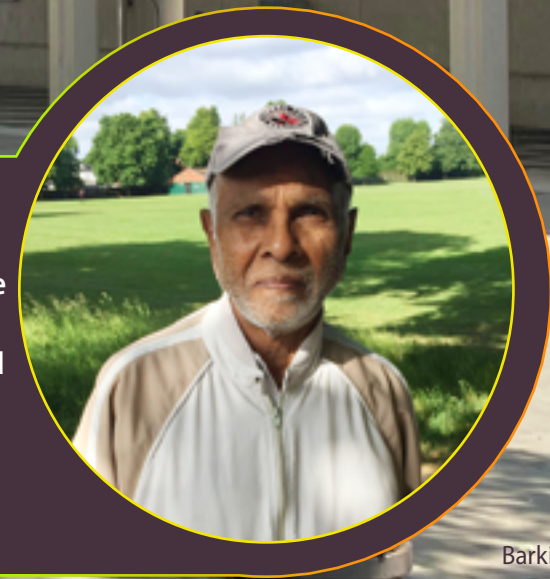
Barkingside High Street