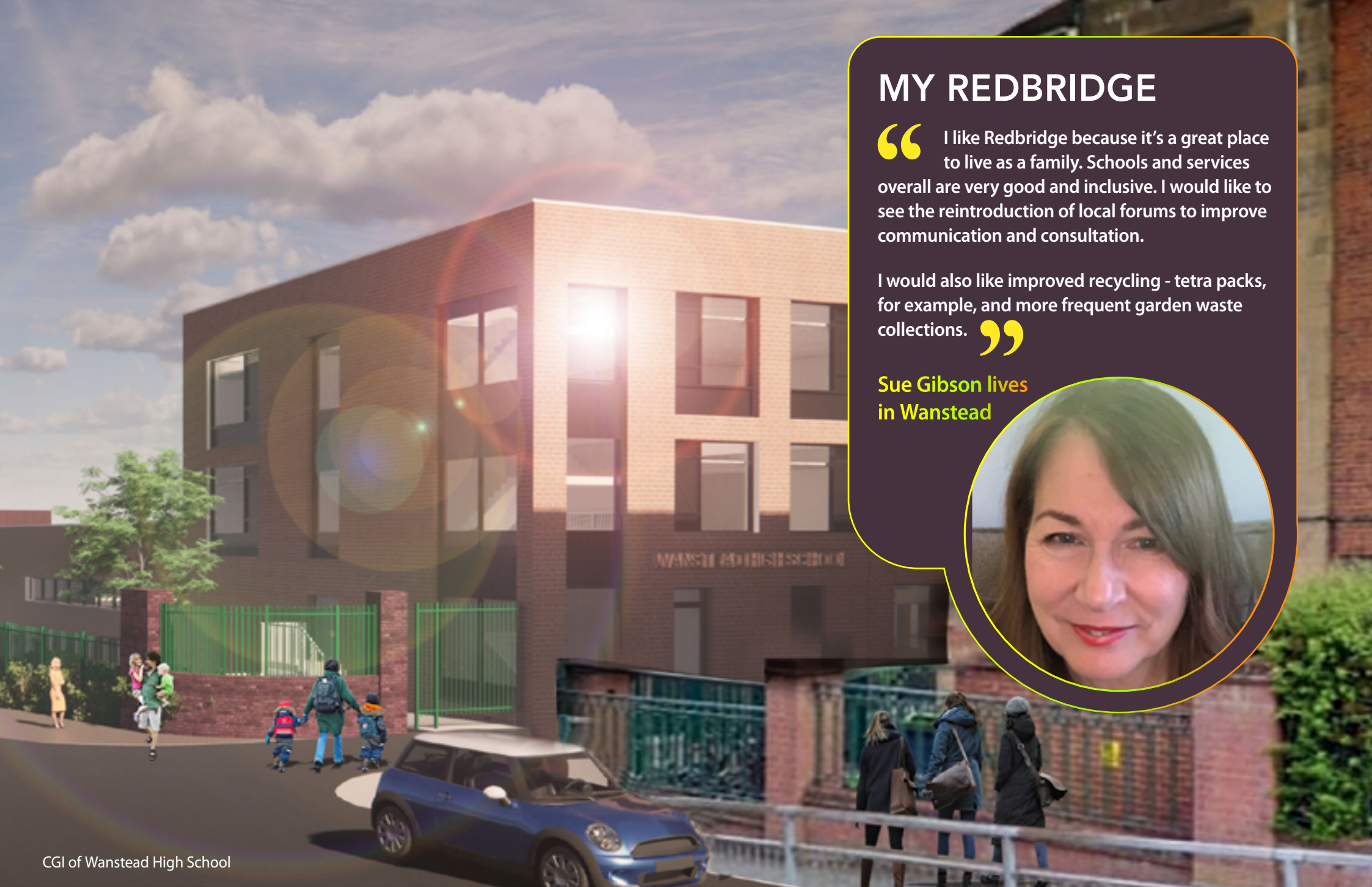
CGI of Wanstead High School